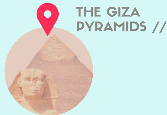
THE GIZA PYRAMIDS //